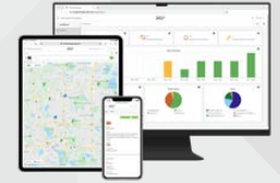
Manage this device with Digi Remote Manager